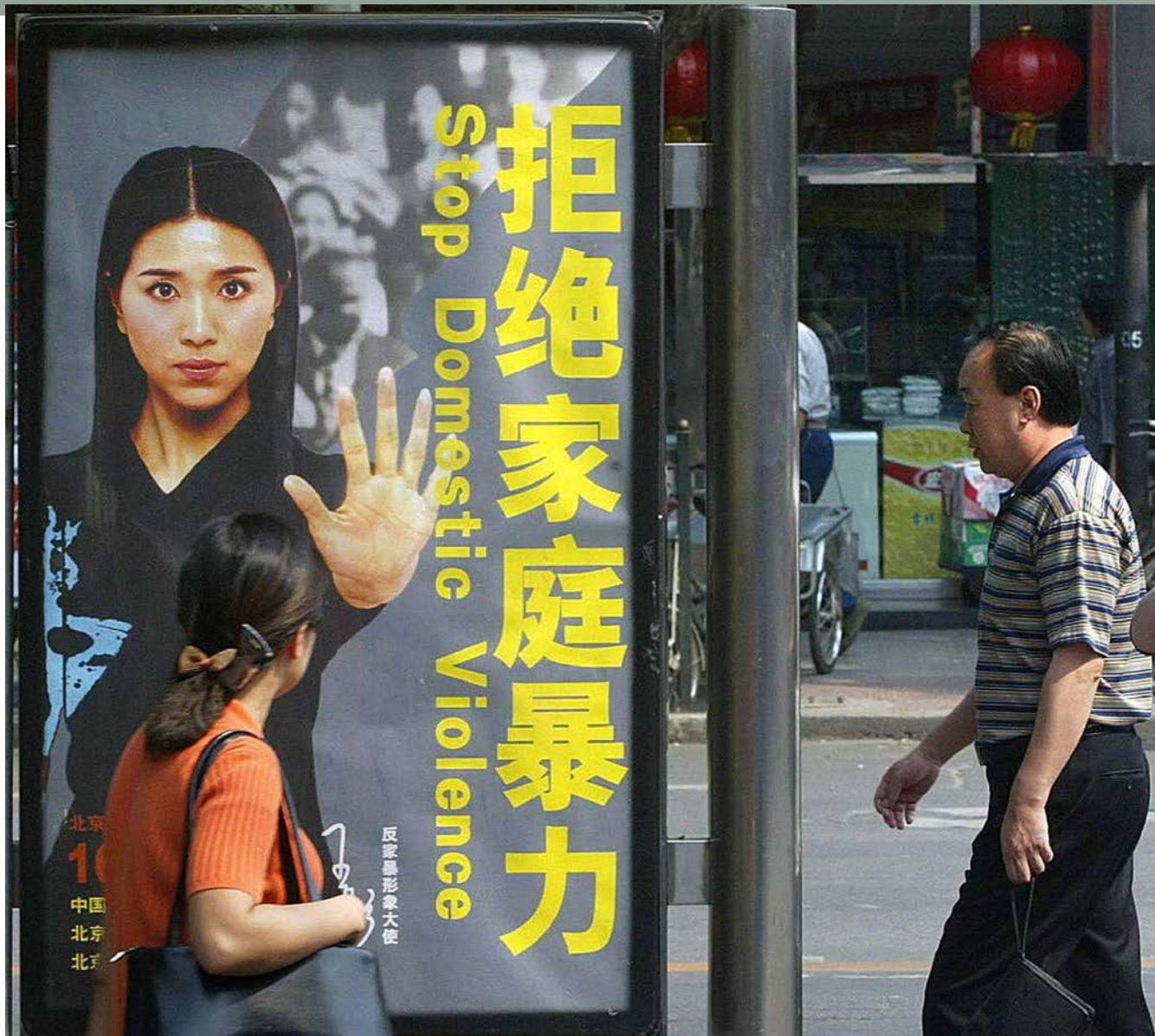
A 2014 billboard in Beijing advocating for putting a stop to domestic violence.